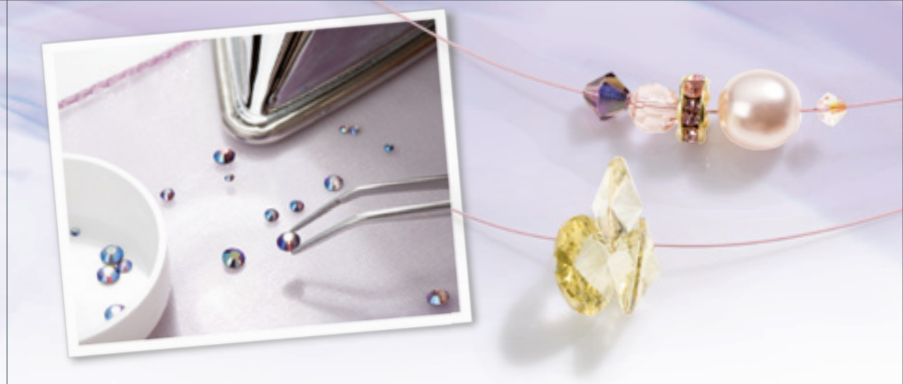
Gluing, setting/clay modelling.

Expensive cut stones have decorated jewellery, clothing and luxury items since the 14th century?